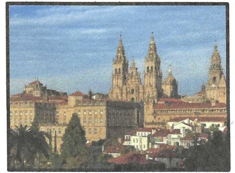
The beautiful Cathedral of Santiago

We have a list of folks we know, all written in a file At Christmas time we take a look and then we have to smile. And that is when we realize that these names are a part Not of the file they're written in, but of our very heart. For each name stands for someone who has crossed our path sometime. Just meeting you has shaped our lives more than you can think. And every year when Christmas comes we realize anew THE BIGGEST GIFT life can give is MEETING FOLKS LIKE YOU. For once you've met somebody, the years cannot erase The memory of a pleasant word or of a friendly face. It warms our heart to think of you at Christmas time each year We hope you have a blessed day and a New Year full of cheer!