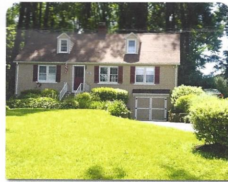
House in Kingsville, MD