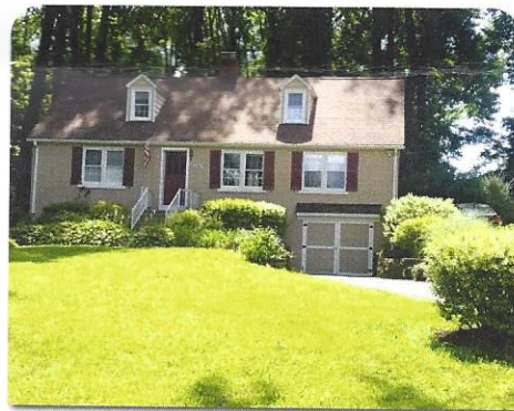
House in Kingsville, MD